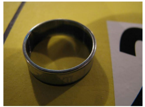
3rd - Syd Birch Stainless Steel Ring