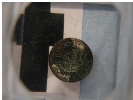
2nd - Syd Birch Novelty Coin