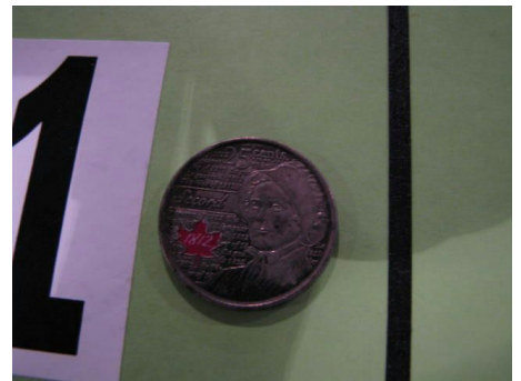
3rd - Syd Birch Cdn. Quarter