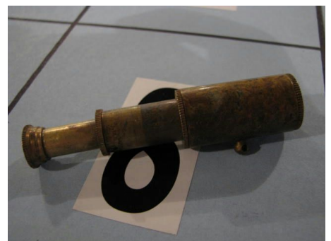
3rd - Paul Snider Brass Mini Telescope