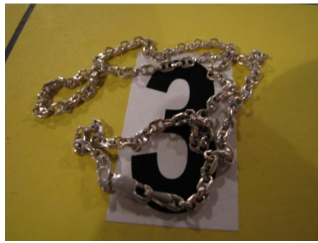
2nd - Ken Dewerson Silver Chain