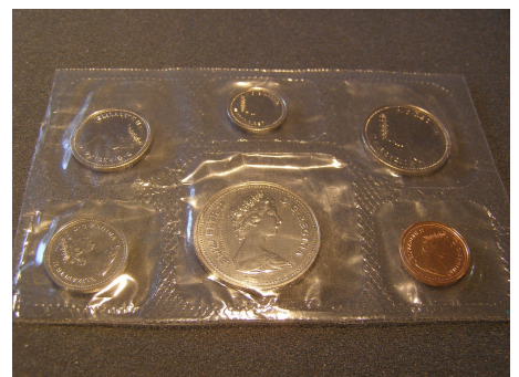
3rd - Bob Omand 1985 Specimen set