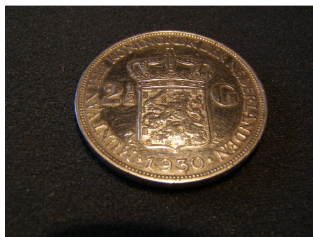
2nd - Samantha Tarbet 1930 Wilhelmina 2.5 Gulden silver coin