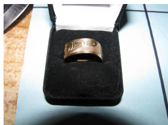
1st - Syd Birch 14K Native Gold Ring