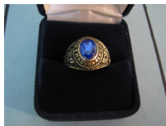
2nd - Paul Snider 10K Blue Sapphire Ring