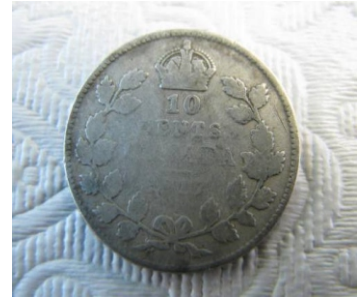
1917 Cdn. Dime Syd Birch