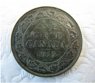
1915 Large Cent Paul Snider