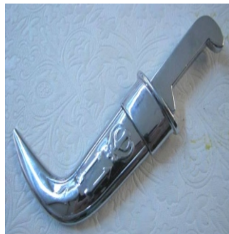
Sikh Kirpan Knife