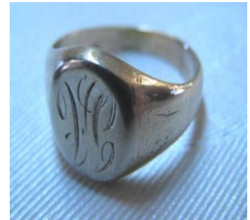
10K Signet Ring Carole Snider