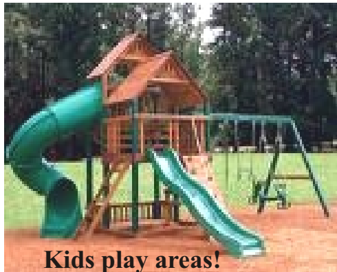
Kids play areas!