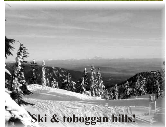
Ski & toboggan hills!