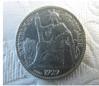
1929 10 Cent Rob Blackie