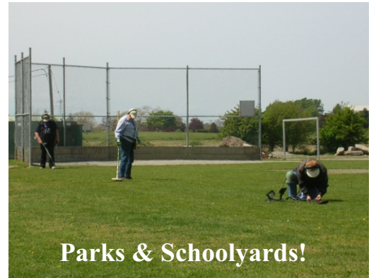
Parks & Schoolyards!