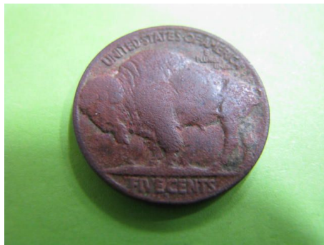
2nd - Brett Johnson 1918 Buffalo 5 Cent