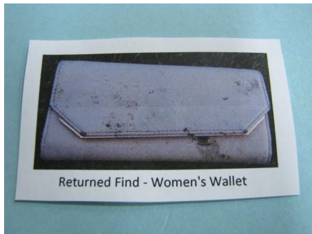
2nd - Carole Snider Wallet Returned