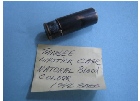
3rd - Elef Christenson Old Lipstick Case