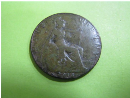
1st - Paul Snider 1918 1/2 Penny