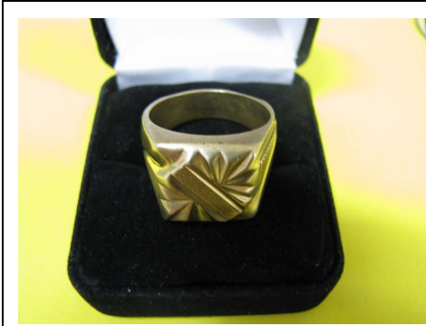
1st - Syd Birch 18K Gold Ring