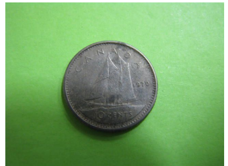
3rd - Gradon Friedt 1970 10 Cent