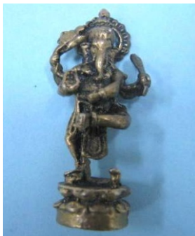
Asian Figurine Syd Birch