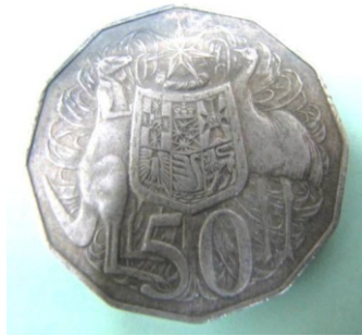
Australian 50 Cent Chris Bilocerowec