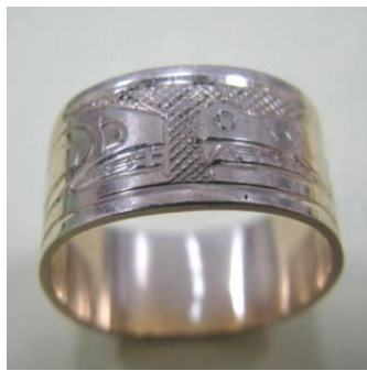
14K Gold Ring Syd Birch