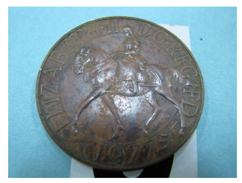
2nd - Paul Snider 1977 British Commemorative Coin