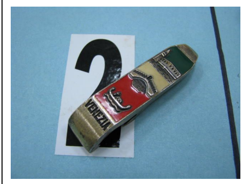
3rd - Syd Birch Italy Bottle Opener