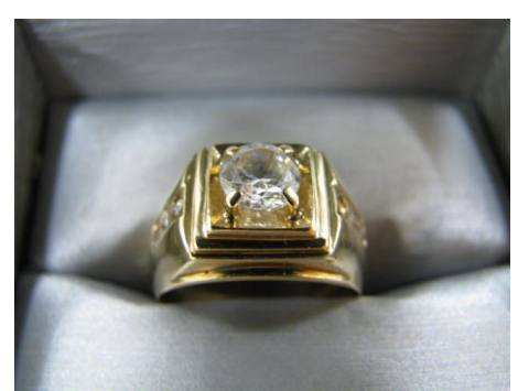
2nd - Paul Snider 14K Gold Ring