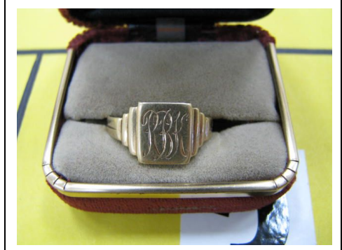
3rd - Ken Dewerson 14K Gold Signet Ring