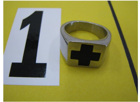
3rd - Syd Birch Black Cross Ring