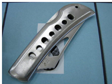
2nd - Ken Dewerson Pocket Knife