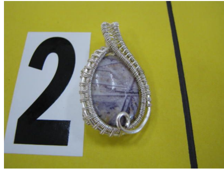
2nd - Bob Shabatura Silver Pendant w/Purple Stone