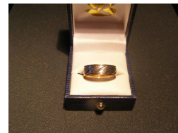
4th - Syd Birch