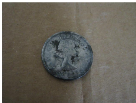
2nd - Carole Snider 1962 Silver Cdn. Quarter