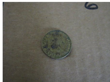
3rd - Brian Doctor 5 PF German Coin