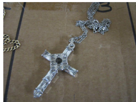
3rd - Maretta Saulnier Cross With Stones