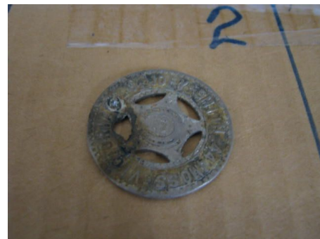
3rd - Syd Birch