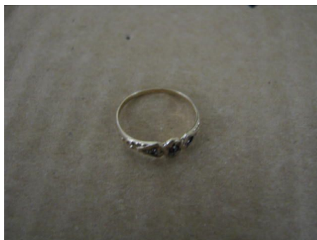
2nd - Syd Birch Gold Ring