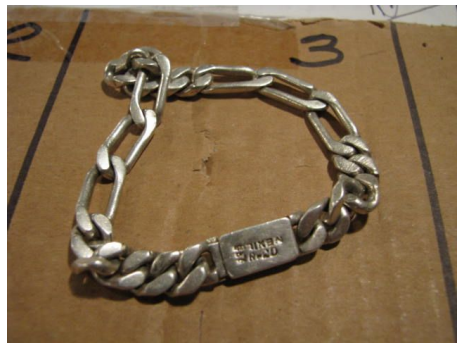
3rd - Paul Snider Silver Bracelet