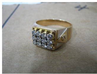
1st - Syd Birch