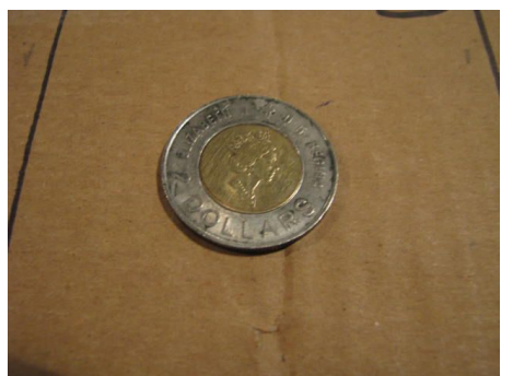
3rd - Syd Birch 3 Bear Toonie