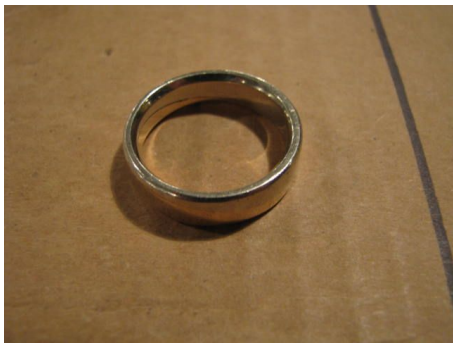
1st - Syd Birch 14K Gold Ring