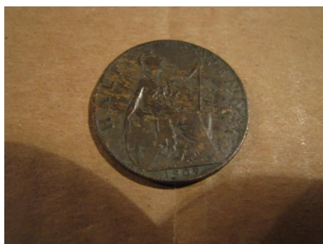
2nd - Paul Snider 1909 British Half Penny