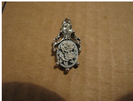
2nd - Ken Dewerson Silver Earring