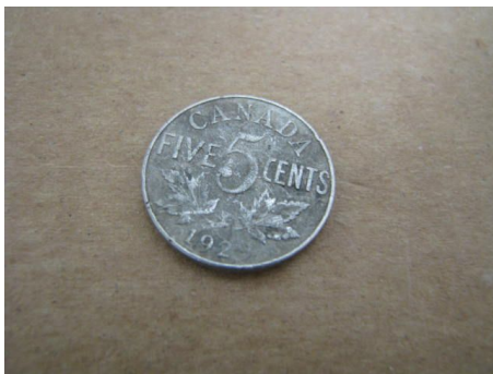
1st - Ken Dewerson 1929 Cdn. 5 Cents