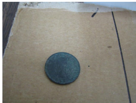
2nd - Syd Birch 1962 Cdn. Quarter