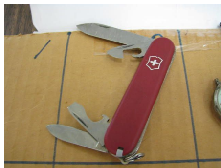
2nd - Bob Shabatura Swiss Army Knife