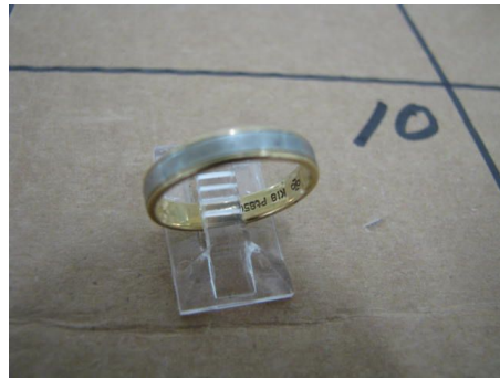
2nd - Ken Dewerson 18K Platinum/Gold Ring