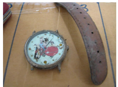
3rd - Hank Vodarek Wallace & Gromit Watch