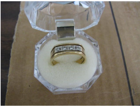
1st - Rob Blakie Ladies Diamond Ring