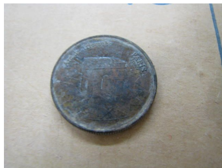
2nd - Carole Snider Paris France Collector Token