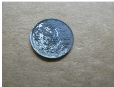
2nd - Brian Doctor 1917 Little Nickel