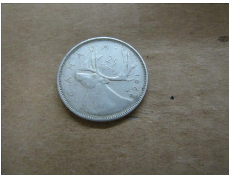
1st - Syd Birch 1966 Silver Quarter