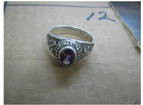
3rd - Paul Snider Silver School Ring