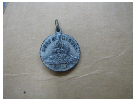
3rd - Syd Birch Religious Medal