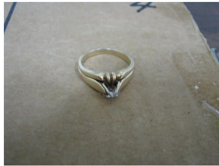
2nd - Syd Birch Gold Ring