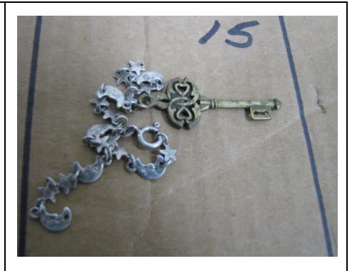
3rd - Thor Aasland Silver Charm Bracelet w/key