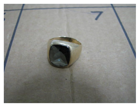
2nd - Paul Snider 10K Gold Ring