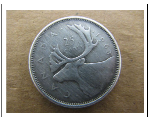
3rd - Ken Dewerson 1963 Cdn. Quarter