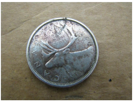
2nd - Syd Birch 1960 Cdn. Quarter