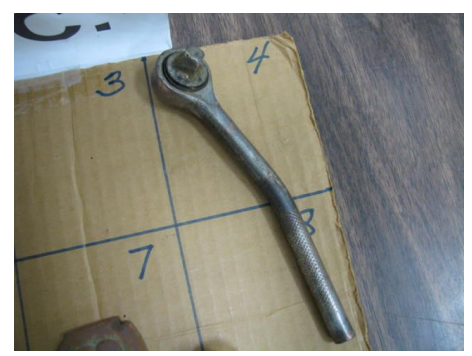
2nd(tied) - Syd Birch Wrench