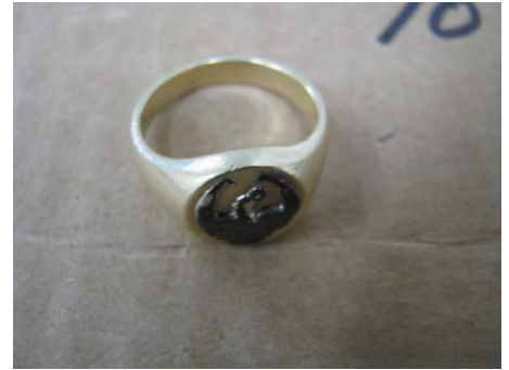
3rd - Paul Snider 10K Gold Ring/Silver Eagle