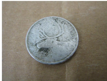
2nd - Jim Tennant 1943 Cdn. Quarter