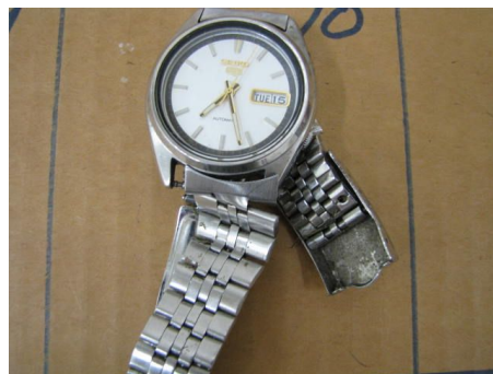
2nd - Paul Snider Seiko Watch