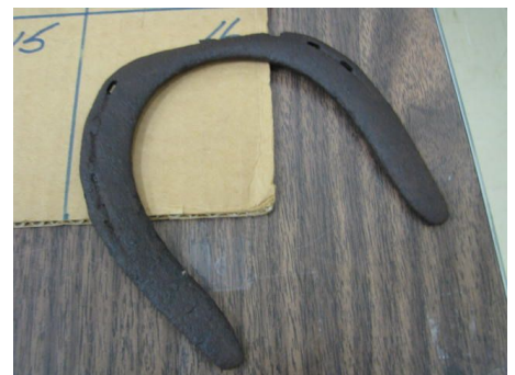
3rd - Roger Taylor 100 Yr Old Horseshoe