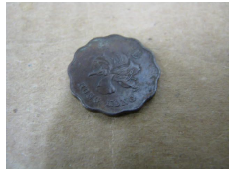
3rd - Samantha Tarbet Hong Kong 20 Cent