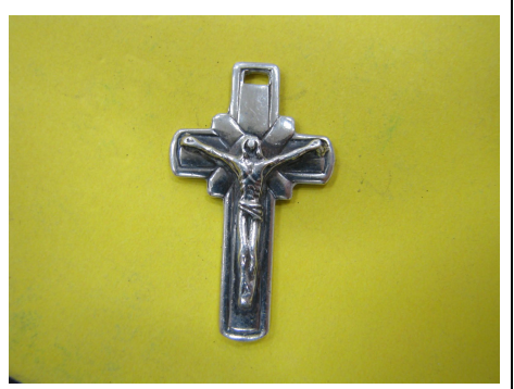
2nd - Rob Blackie Crucifix