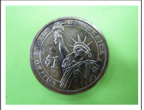
3rd - Rob Blackie US $1 Coin