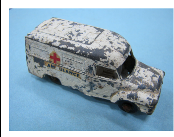
3rd - Greg Degagne Lomas Ambulance