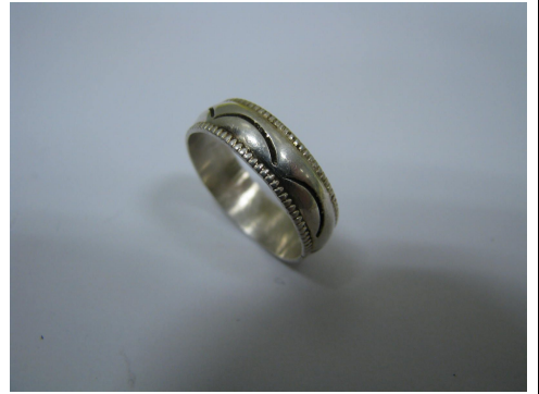
3rd - Syd Birch Silver Ring