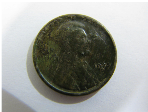
2nd - Paul Snider 1925 US Wheat