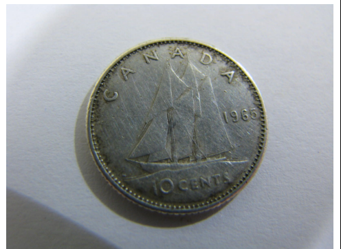
3rd - Samantha Tarbet 1965 Silver Dime