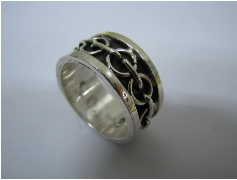
1st - Rob Blackie Silver Filigree Ring