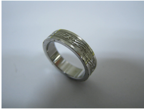
2nd - Paul Snider Cool Ring