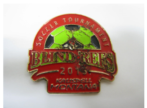
3rd - Syd Birch Soccer Pin